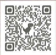
Scan for THS Band and Guard CHARMS Calendar