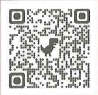
Scan for THS Band and Guard Boosters BAND APP Page