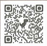
Scan for Tiger Band and Guard Parent Facebook Page