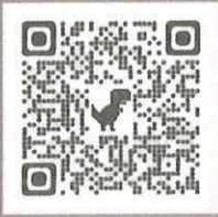
Scan for THS Band and Guard CHARMS Calendar