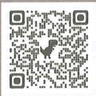
Scan for Tiger Band and Guard Parent Facebook Page