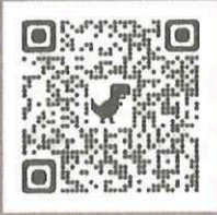
Scan for THS Band and Guard Boosters BAND APP Page