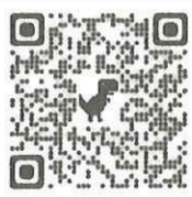
Scan for Tiger Band and Guard Parent Facebook Page