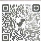
Scan for THS Band and Guard CHARMS Calendar