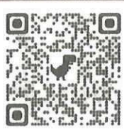
Scan for THS Band and Guard Boosters BAND APP Page