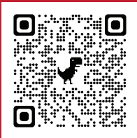
Scan for Tiger Band and Guard Parent Facebook Page