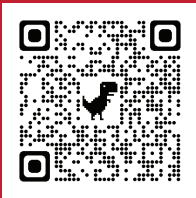
Scan for THS Band and Guard Boosters BAND APP Page